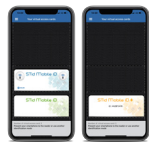
Bluetooth® & NFC smartphones using STid Mobile ID® application