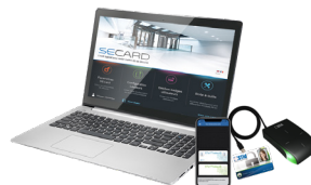
SECard configuration kit and SSCP, SSCP2 & OSDP™ protocols