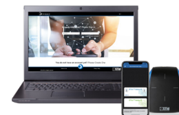
STid Mobile ID® Online Portal Web platform for remote management of your virtual badges